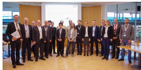
Figure 3. Participants at VW's "Gläserne Manufaktur" (The transparent Factory)