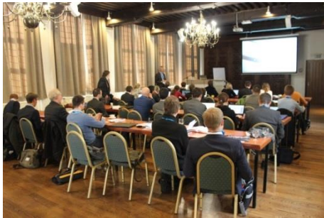
Figure 5. IPW 2016 Session

will also be an opportunity for researchers and practitioners, academics and engineers to meet, exchange ideas and gain insights from each other.