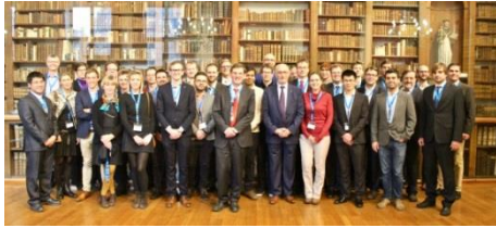
Figure 4. Participants of IPW 2016

The next conference will be in Dresden on 27 to 29 September 2017. Further upcoming conferences will be in Austria (Vienna 2018), Scotland (Edinburgh 2019) and Portugal (2020).